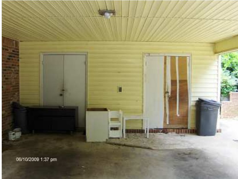
Paint peeling from exterior door (18-34d)