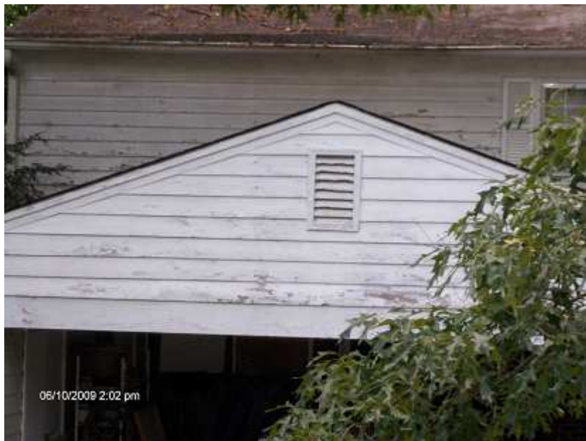
Paint peeling from walls (18-34d)