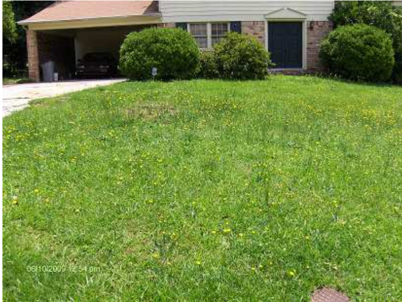
Weeds exceeding 12" (18-38c)