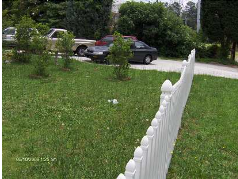
Weeds exceeding 12"