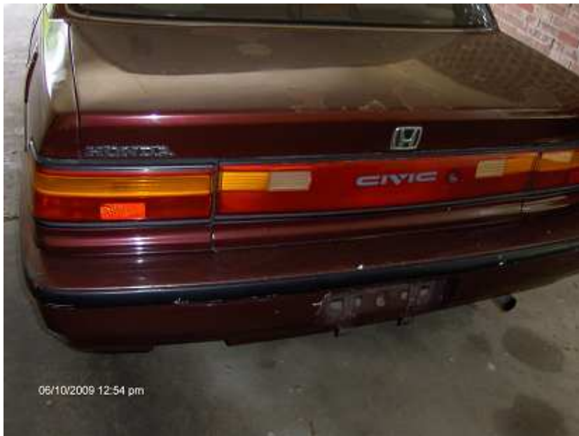
Unregistered vehicle (18-8)