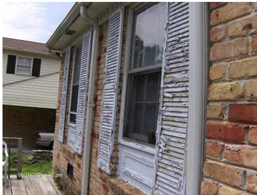
Shutters with peeling paint (18-34d)